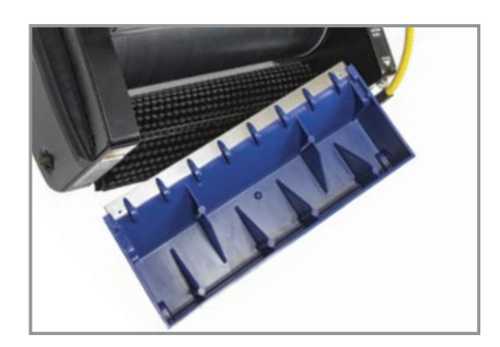
Removable recovery tank yields easy cleanup.