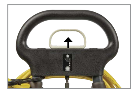
Pull handle dispenses solution on to floor.

The Multiwash offers quiet, high quality cleaning performance, versatility, ease of use and durability. This machine will wash, mop, scrub and dry in a single pass on virtually every kind of floor. The Multiwash can even be used on escalators and entrance matting.