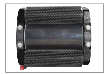
Counter-rotating brushes and recovery drum clean and clear debris in one pass.