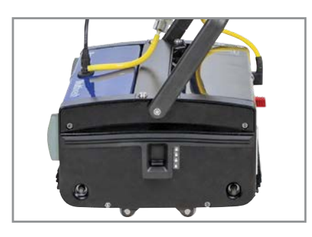
Low profile makes for easy cleaning under chairs and food prep areas.