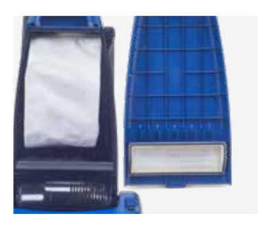
HEPA BAG AND HEPA EXHAUST FILTER