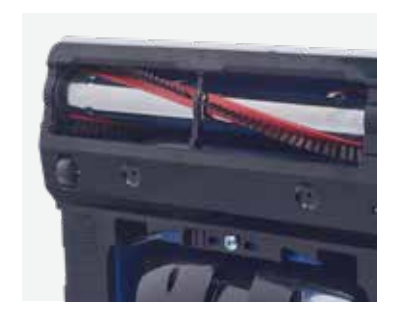
METAL BRUSHROOL WITH REPLACEABLE BRUSH STRIPS