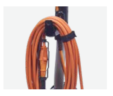
40' CORD WITH PIGTAIL