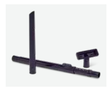
INCLUDES CREVICE TOOL AND DUSTING/ FURNITURE COMBO TOOL