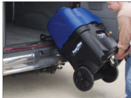
Wheeled handle for ease of loading and unloading, even with only one person.