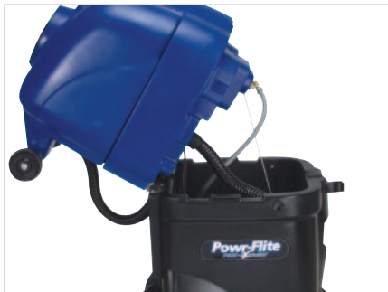
Clam shell design allows easy access to pump and heater.