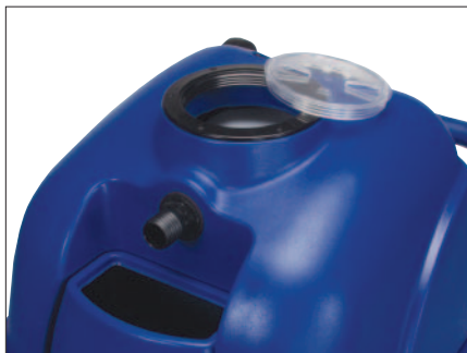
Large solution and recovery tank openings for easy tank cleanup and filling.