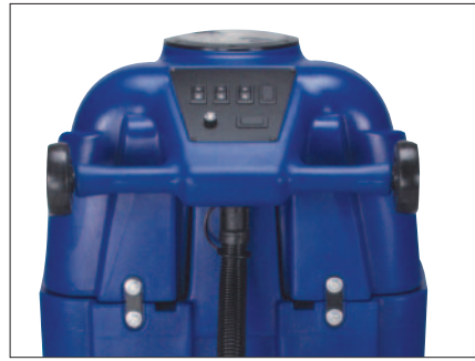
Independent motors, pump and heater switches.