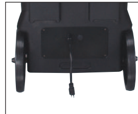
Single corded unit for non-heated models and model PFX1350-100H (car wash extractor)