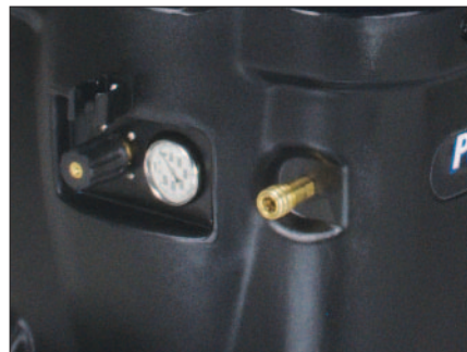
Front mounted pressure gauge on 200 - 400 p.s.i. models and recessed brass connector.