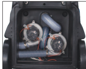
201 CFM with parallel motor configurations.