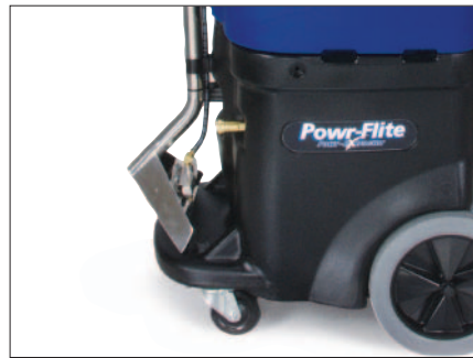
Tools fit right on the unit for easy portability.