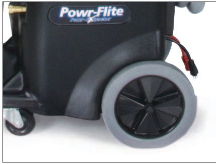
Large 12" stair climbing wheels and dual pig-tail on heated models.