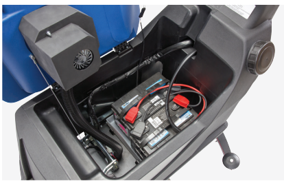
EASY ACCESS TO MOTOR, BATTERIES AND TANKS