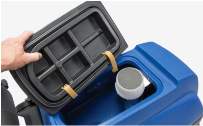
RECOVERY TANK FILTER