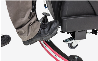
FOOT CONTROLLED BRUSH LEVER