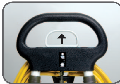
Pull handle dispenses solution on to floor.

The Multiwash offers quiet, high quality cleaning performance, versatility, ease of use and durability. This machine will wash, mop, scrub and dry in a single pass on virtually every kind of floor. The Multiwash can even be used on escalators and entrance matting.