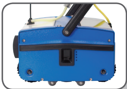
Low profile makes for easy cleaning under chairs and food prep areas.