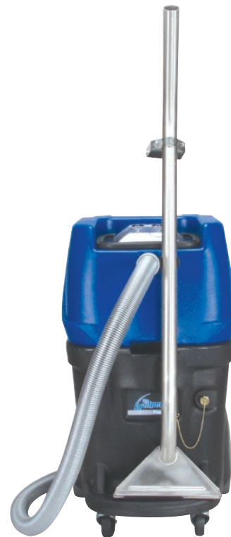
An optional wand fits right on the machine for easy transporting and storage.