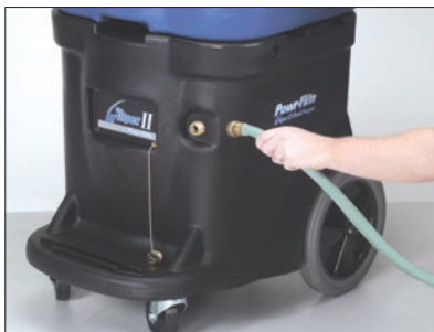
Connect an ordinary garden hose for handy waste water discharge.