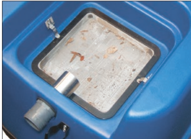
Convenient waist high, extra large filter catches large debris - no more reaching through wastewater!

The Gulper II is extremely easy to operate and works efficiently. The single power cord operation minimizes blown breakers and searching for additional circuits when electrical power is at a premium. Additionally, you don't have to worry about carrying long, bulky hoses around for discharge. The Gulper II connects to an ordinary garden hose so you can use as many, or as few, as you need to drain the waste water exactly where you need it to go. The Gulper II also features a large 9" x 9" access opening to make clean up a snap. Large debris is caught on the 50 gauge steel mesh filter for easy disposal.