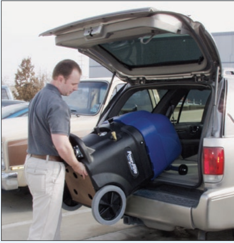
With one-man loading, one operator can load and unload the Gulper II easily.