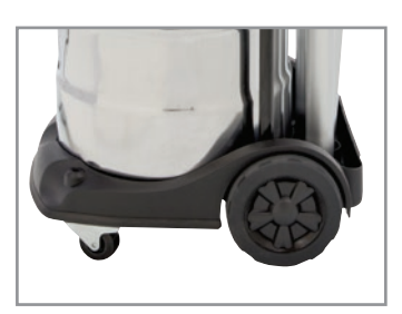
See the PF59 in action at Powr-Flite.com/Videos

I I Heavy-duty ball-bearing casters with safety lock to prevent accidental rolling