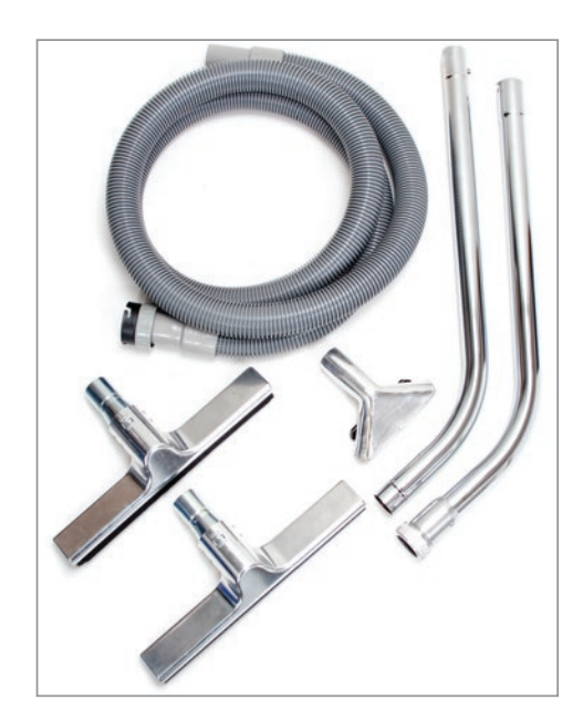
10' swivel hose, 2-piece all metal wand and floor/rug and squeegee tools