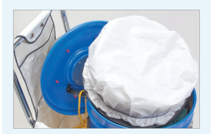
Optional cloth filter bag