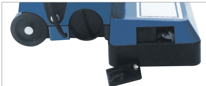
Service access door makes replacing the single brush strip very easy!

Both units have hard floor and carpet settings that let you vacuum any floor surface and detail tools that let you clean overhead areas and upholstery. An easy access side door lets you change brush strip with no hassle. The brush roll only operates when the handle is in the operating position. Electronic sensing controls include auto stop to prevent belt and motor wear and cord power connection indicator for easy replacement and troubleshooting.