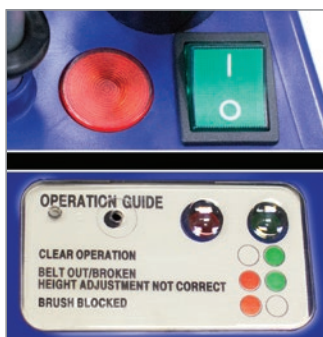
Electronic sensing controls