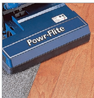
Cleaning power for hard surfaces and carpets