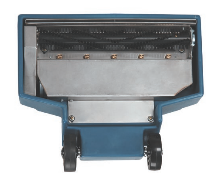
17" wide cleaning path