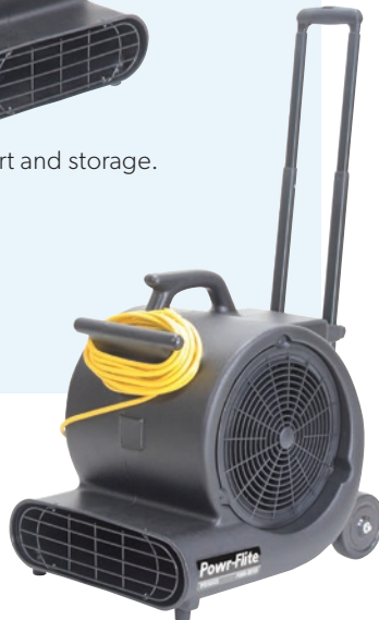
PD500DX model includes telescoping handle.