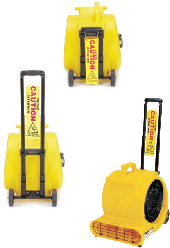
Powr-Flite Safety Dryer - Model PD500DX-YS with high visibility yellow housing and permanently attached caution banner.