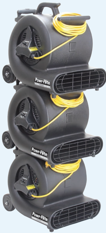
Stackable for transport and storage.