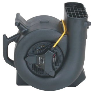
Easy vertical operation.

Engineered for high performance and efficiency, Powr-Dryers feature maximum airflow in a streamlined housing designed to reduce performance loss, along with 3 speed settings for lower amp draw. The stackable design provides easy transportation and storage and also meets OSHA standards for maximum weight and size. Our full featured Powr-Dryers have the drying power for everything from delicate drapes to flooded sheetrock.