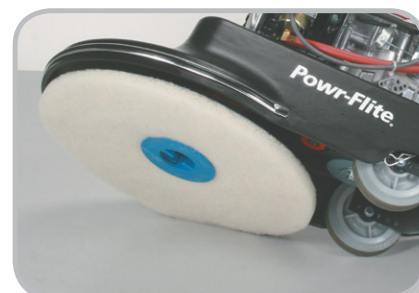
Tilt design for easy pad changes

Powr-Flite® high performance propane burnishers provide first class results year after year. At the heart of each unit is the powerful 17 hp Kawasaki® engine which has been the choice of professionals for years. These powerful motors produce 1850 RPM and are mounted on rugged cast aluminum decks. Pads are mounted to flexible pad drivers which conform to the unique undulations in every floor, preventing burn spots. Adjustable and ergonomically designed handle reduces operator fatigue.