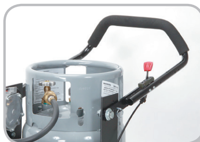
Handle adjusts for operator comfort