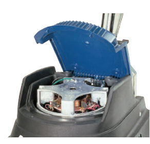
Easy access to motor and internal components! The completely enclosed motor and no exposed wires means longer lasting durability, with easy access for quick maintenance