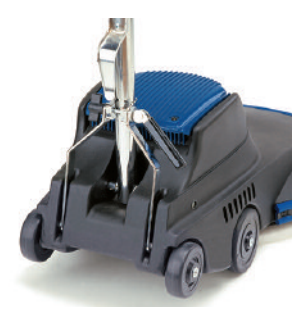
Strong reinforced handle yoke! Reinforcing the handle yoke and solid axle support provides strength and support for smoother operation and improved performance