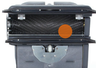
Dual squeegee system and cylinder brush for cleaning all hard floors.