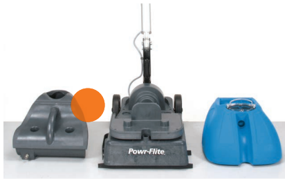
SIMPLE CLEAN/FILL The removable solution and recovery tanks lift off for easy emptying and filling.