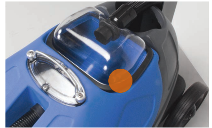
Clear lid for monitoring recovery.