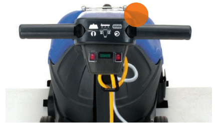
EASE OF USE Control panel on the handle.