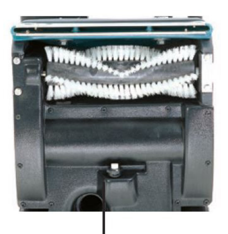
SOLUTION SPRAY JET