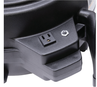
BUILT-IN POWER OUTLET CAN DAISY CHAIN 4 PDH2 UNITS TOGETHER

The PDH2 model can be daisy chained with up to 4 units on a dedicated 15 amp circuit with the built in power outlet.