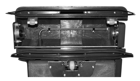
Clean and inspect spray bar.