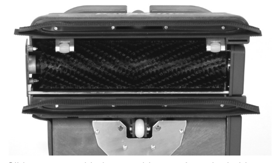
Slide squeegee blades out sideways from the holder.