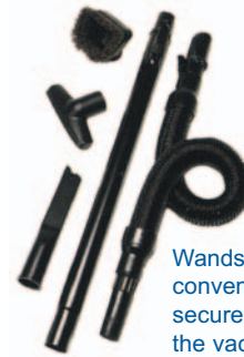
Wands and tools fit conveniently and securely right on the vacuum