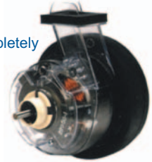
The 9 amp long life motor is completely sealed inside the vacuum