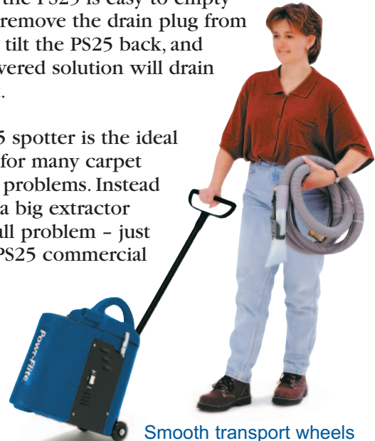
Smooth transport wheels

The PS25 spotter is the ideal solution for many carpet cleaning problems. Instead of using a big extractor for a small problem - just use the PS25 commercial spotter!