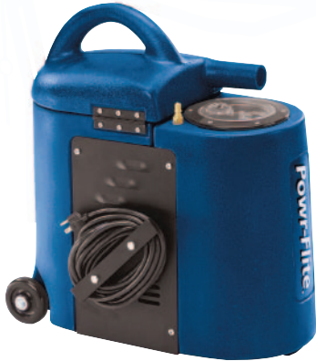
All steel cord wrap

The PS25 commercial spotter is portable, light-weight, and extremely powerful. It is perfect for touch-ups, spot removal between scheduled carpet cleanings, and those locations where the bigger extractors just won't fit. And, you can use it to pick up small wet spills quickly and easily. The PS25 takes the hassle out of cleaning spots before they become a major stain.