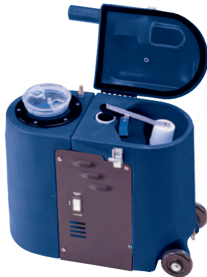
Float shut-off system for protection of vacuum motor

Power-Flite COMMERCIAL FLOOR CARE EQUIPMENT