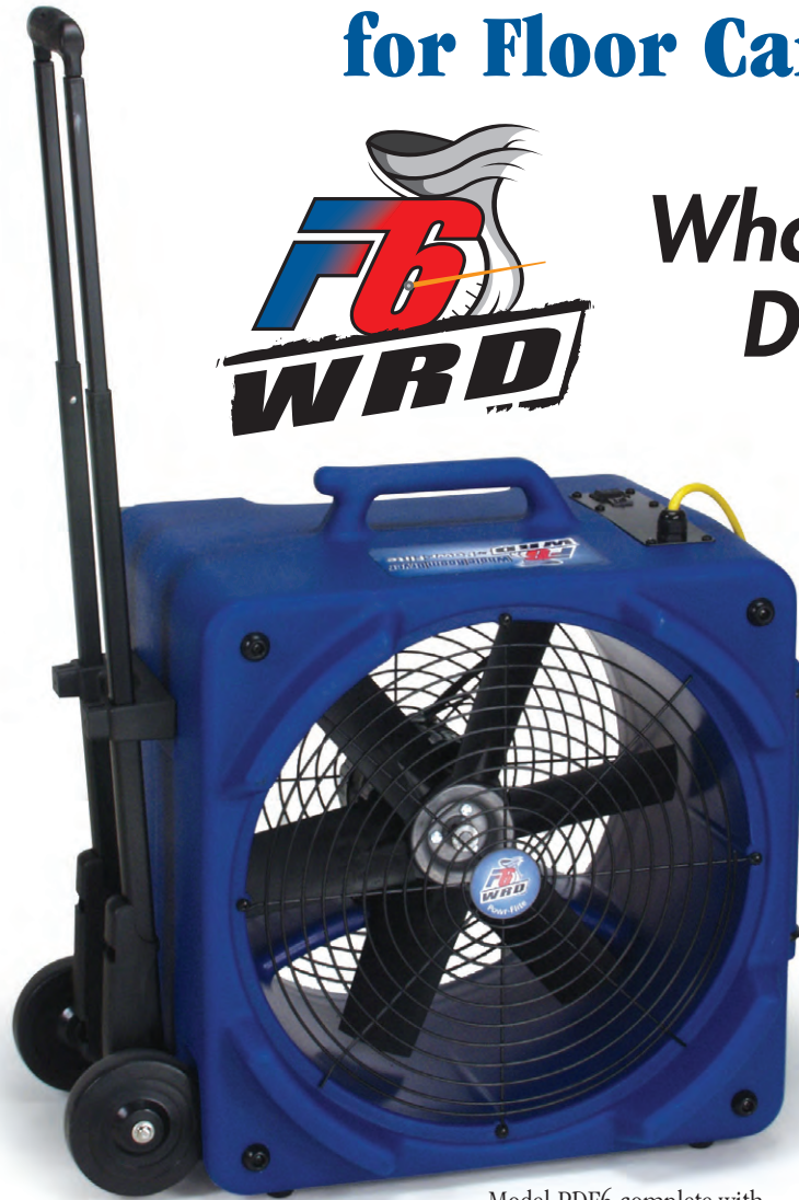
Model PDF6 complete with telescopic handle and wheels.