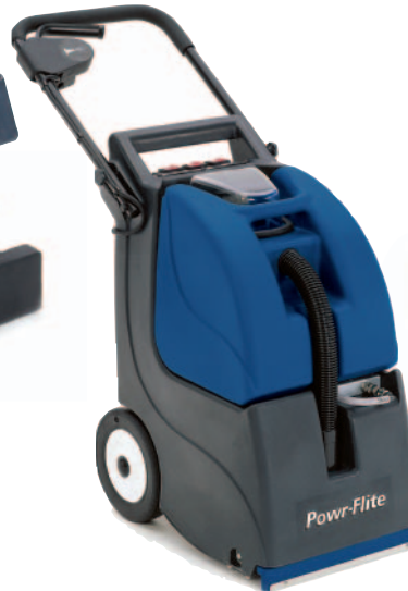
3 gallon model