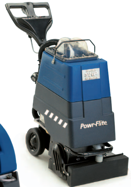
7 gallon model