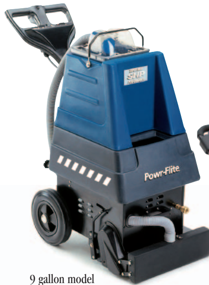
9 gallon model