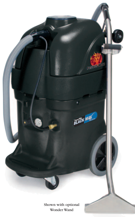
Shown with optional Wonder Wand

Black Max - the super charged portable extractor with truckmount power! With two 3-stage vacuum motors, Black Max provides the ultimate in portable extraction with 200" of water lift at 101 CFM. Combine that power to blast the carpet fibers clean with the strong 400 p.s.i. pump with the forceful recovery to dry carpets fast. The Black Max also features the patent pending Perfect Heat system for the hottest water temperature available in the portable market today. Dirt doesn't stand a chance! With the Black Max you get maximum power for super clean carpets that dry fast!